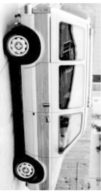
The "New" Van