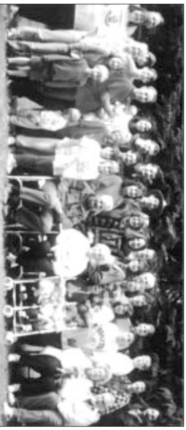
1997 Colton Family Reunion, Silver Falls, OR