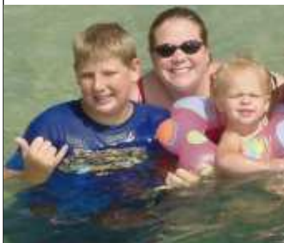
... continued on page 3