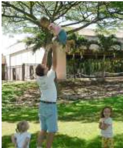
Fun at Pearl Harbor